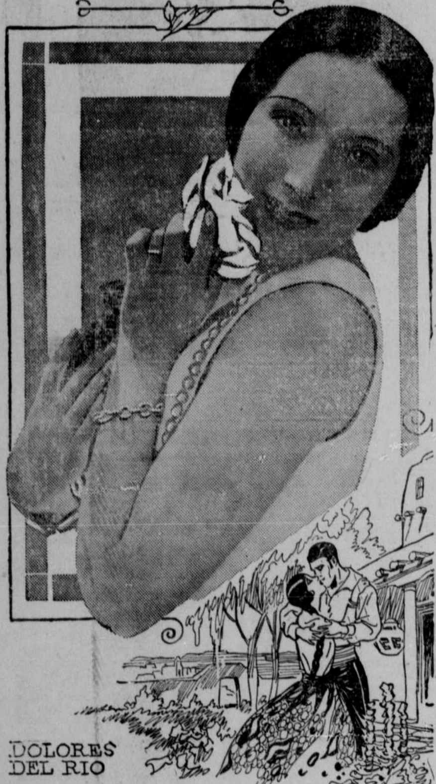
DOLORES DEL RIO

Ra-mon-a, I hear the music on bells above, — Ra-mon-a, they're ringing out our songs of love