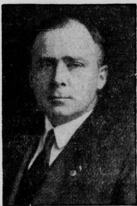
ROBERT G. SIMMONS Reelected to Congress from the Sixth District.

There were five democratic senate seats which hung so narrowly in the balance that the result could not be announced twelve hours after the polls had closed. Inasmuch as not a single republican seat seemed still at stake, it was reasonable to assume the republicans have been able to kill the