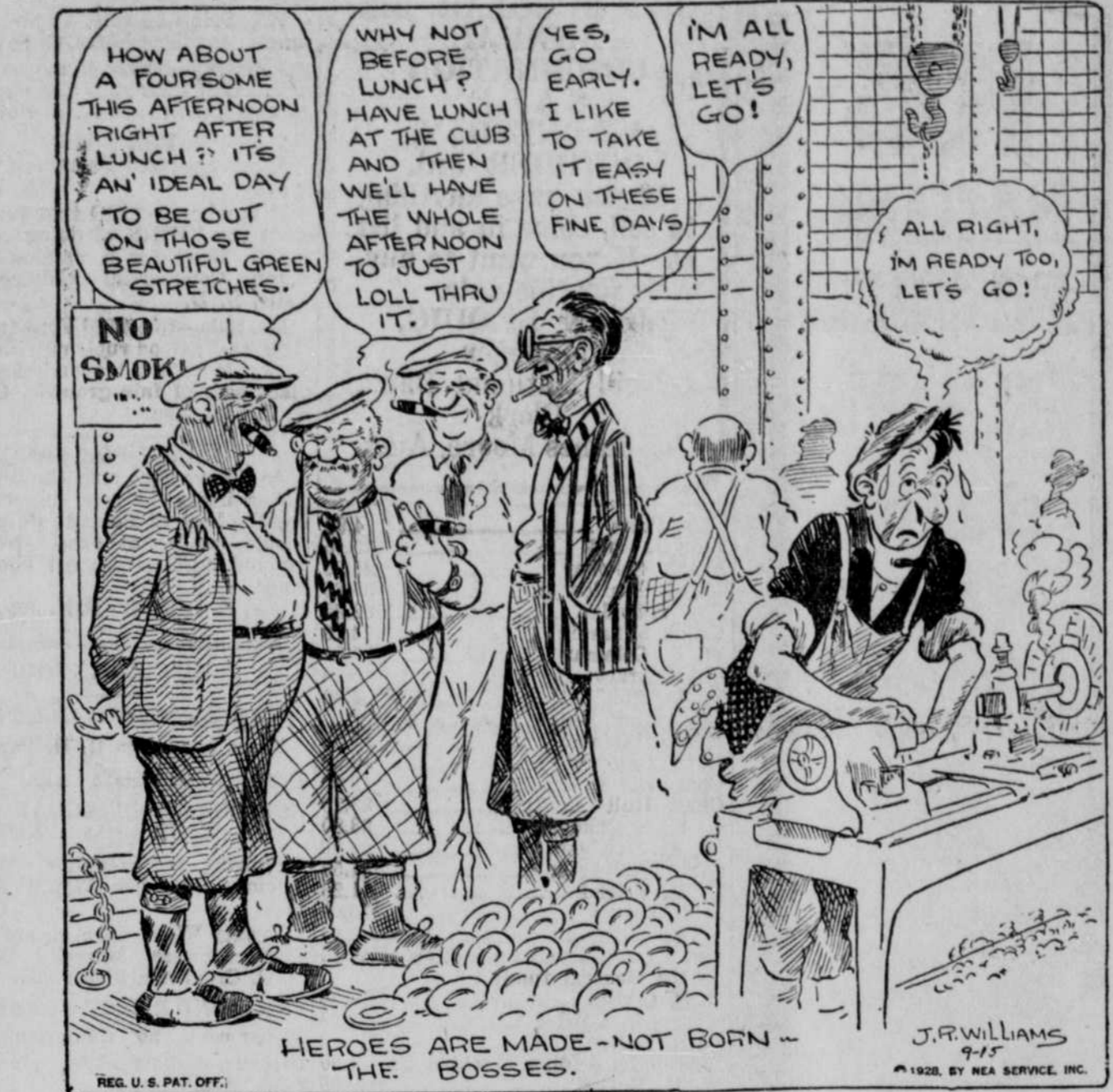
HEROES ARE MADE - NOT BORN - THE BOSSES.