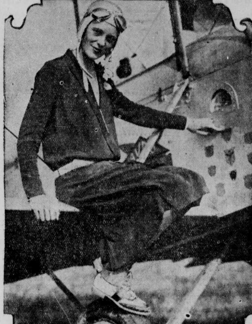
Photo shows Miss Amelia Earhart, trans-Atlantic girl fier, on the wing of sports plane she purchased from Lady Heath in England. Her literary labors over for the present, Miss Earhart is enjoying a vacation by flying two or three hours daily.