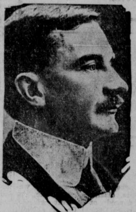
Thousands of Rumanian peasants, as the Peasant party, are led by Juliu Maniu. They are demanding that the Regency dismiss the present Bratianu government, which they claim is not representative of the will of the people.