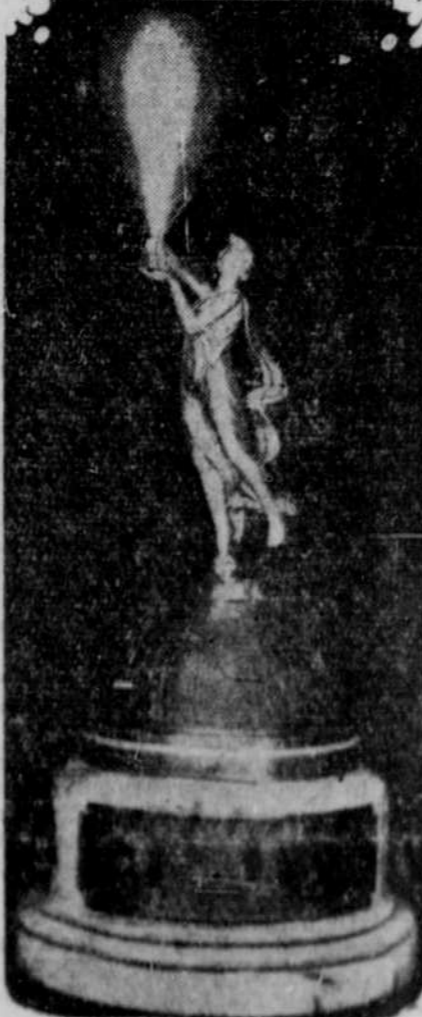
The Litchfield Balloon Trophy, for which balloonists from all over the country will compete in a race at Bettis Field, Pittsburgh, on Decoration Day.