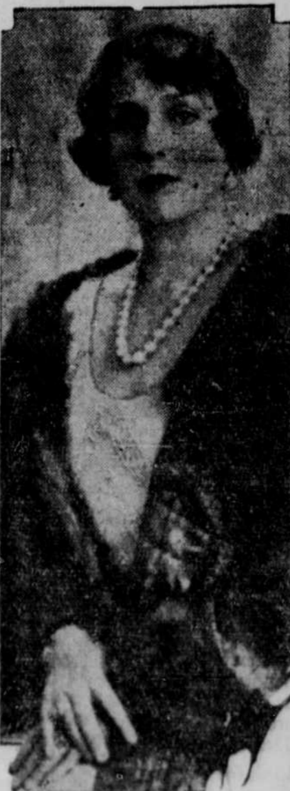
Rumors which were abroad regarding Queen Victoria of Spain, above, were effectually killed by the Vatican. It was rumored that King Alfonso was seeking an annulment, but the Vatican authorities decreed that the marriage of sovereigns was surrounded by such well known guarantees that it was almost impossible to find faults which would make annulment feasible.