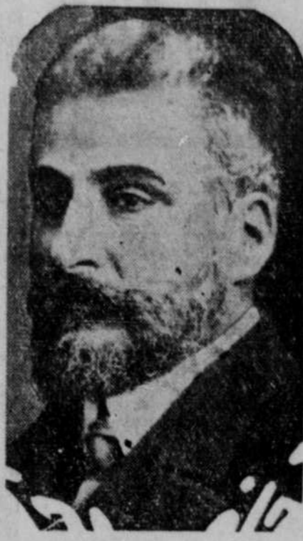
Jans Bratianu, Premier of Rumania, is the target of a demand by the Peasant party that he resign the position. Two hundred thousand peasants have raised their voices in one of the greatest political outbursts in modern Europe.