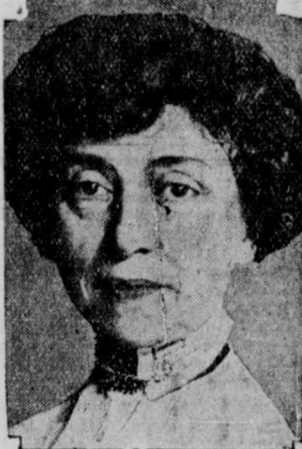
Genevieve Cline of Cleveland is waiting for the Senate to investigate complaints that she isn't fitted to fill the position of associate justice of the United States Customs Court in New York, a post for which she has been recommended by President Coolidge. After the probe, however, Miss Cline expects to land the appointment.