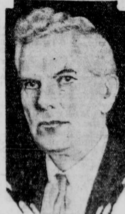
Martin B. Madden, Representative from Illinois, one of the Republican leaders of the House, was stricken with a heart attack at his desk in Washington, D. C., and died instantly.