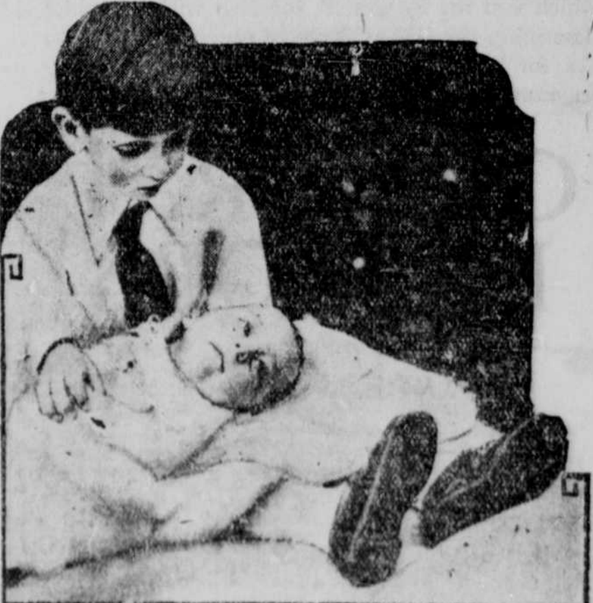
The first time the Crown Prince Peter of Jugoslavia had his picture taken he insisted that his baby brother, Prince Tomislav, should be in the camera. The little Crown Prince takes his duties as nursemaid very seriously.