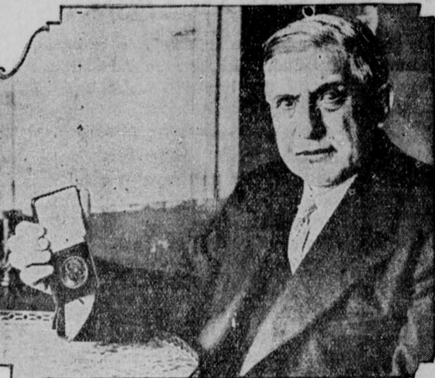
Mr. Charles M. Schwab, American steel king, is back from England with the gold Bessemer medal, which was presented to him by the president of the Iron and Steel Institute of Great Britain. Mr. Schwab made the trip to England especially to receive this honor.