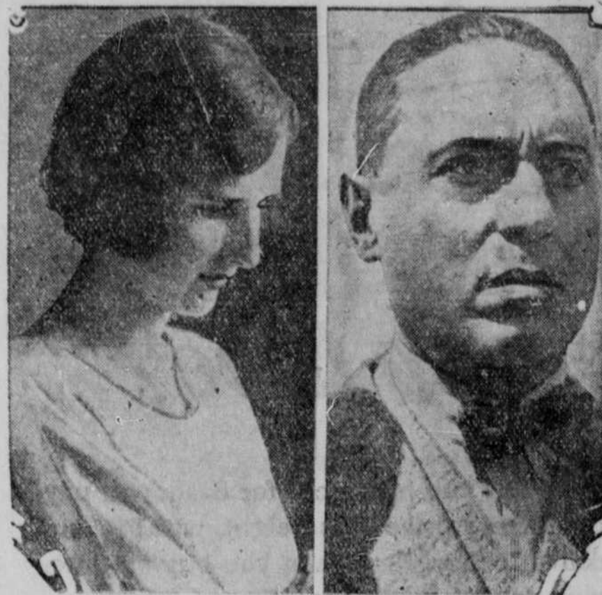
It's being whispered in court circles that Princess Giovanna (left), third daughter of the King of Italy, may soon become the bride of the Marquis de Pinedo (right), ace of aviators. De Pinedo is just past 40 years of age, while the Princess is 21.