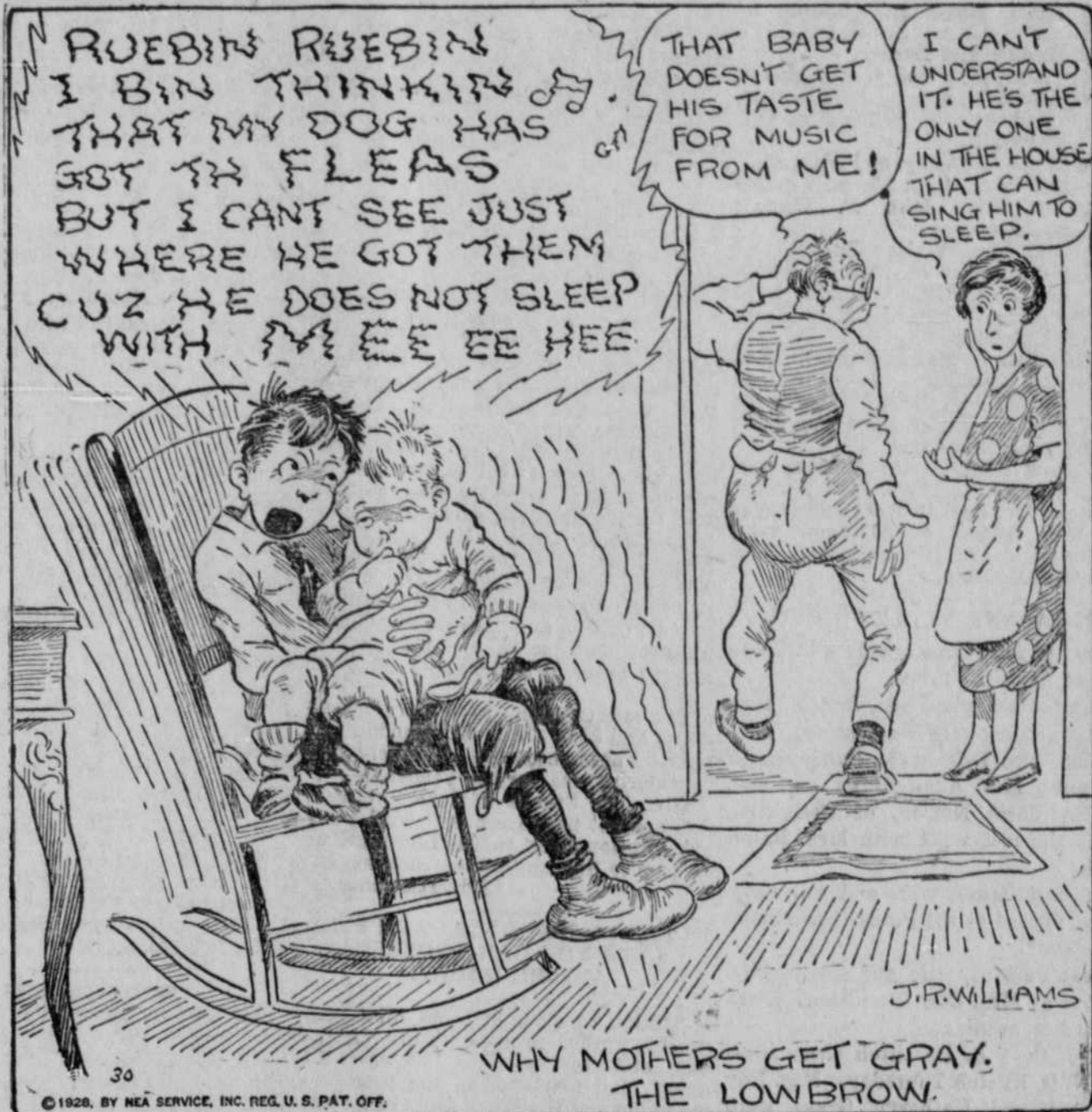
WHY MOTHERS GET GRAY. THE LOWBROW.