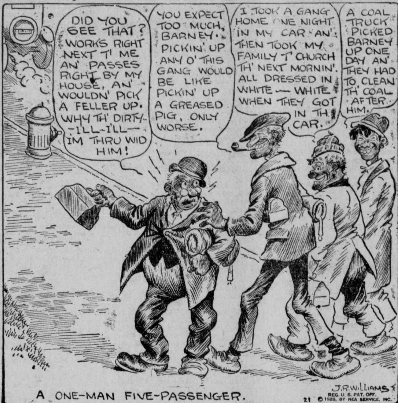
A ONE-MAN FIVE-PASSENGER.