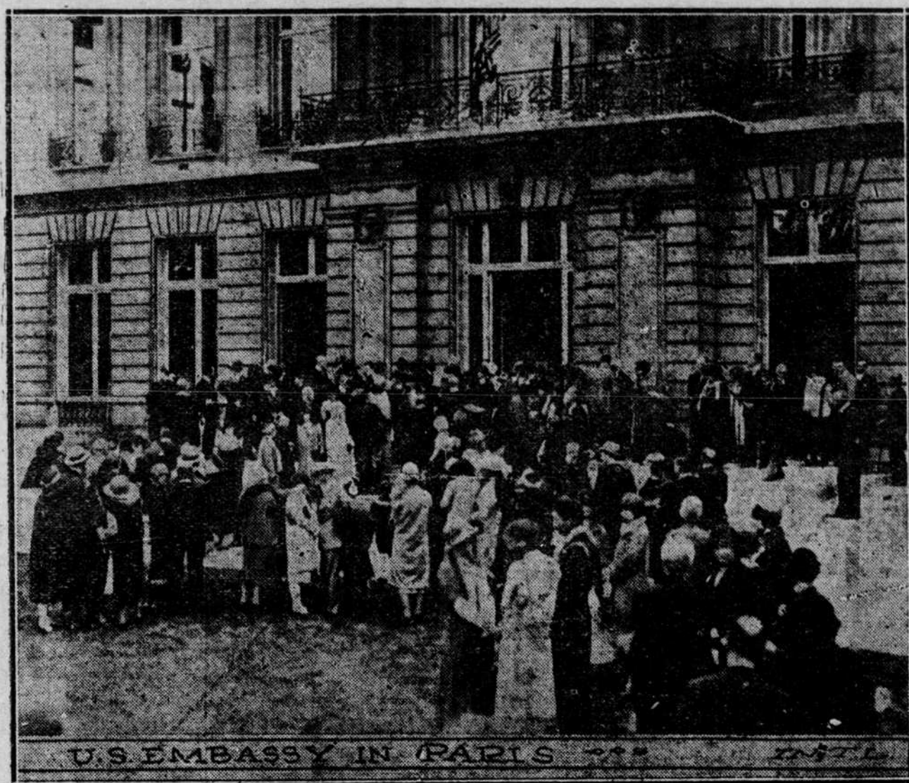
The opening of the American embassy in Paris, the first owned by the United States in Europe, was the occasion for a celebration attended by 3,000 persons. Ambassador Herrick welcomed the guests.