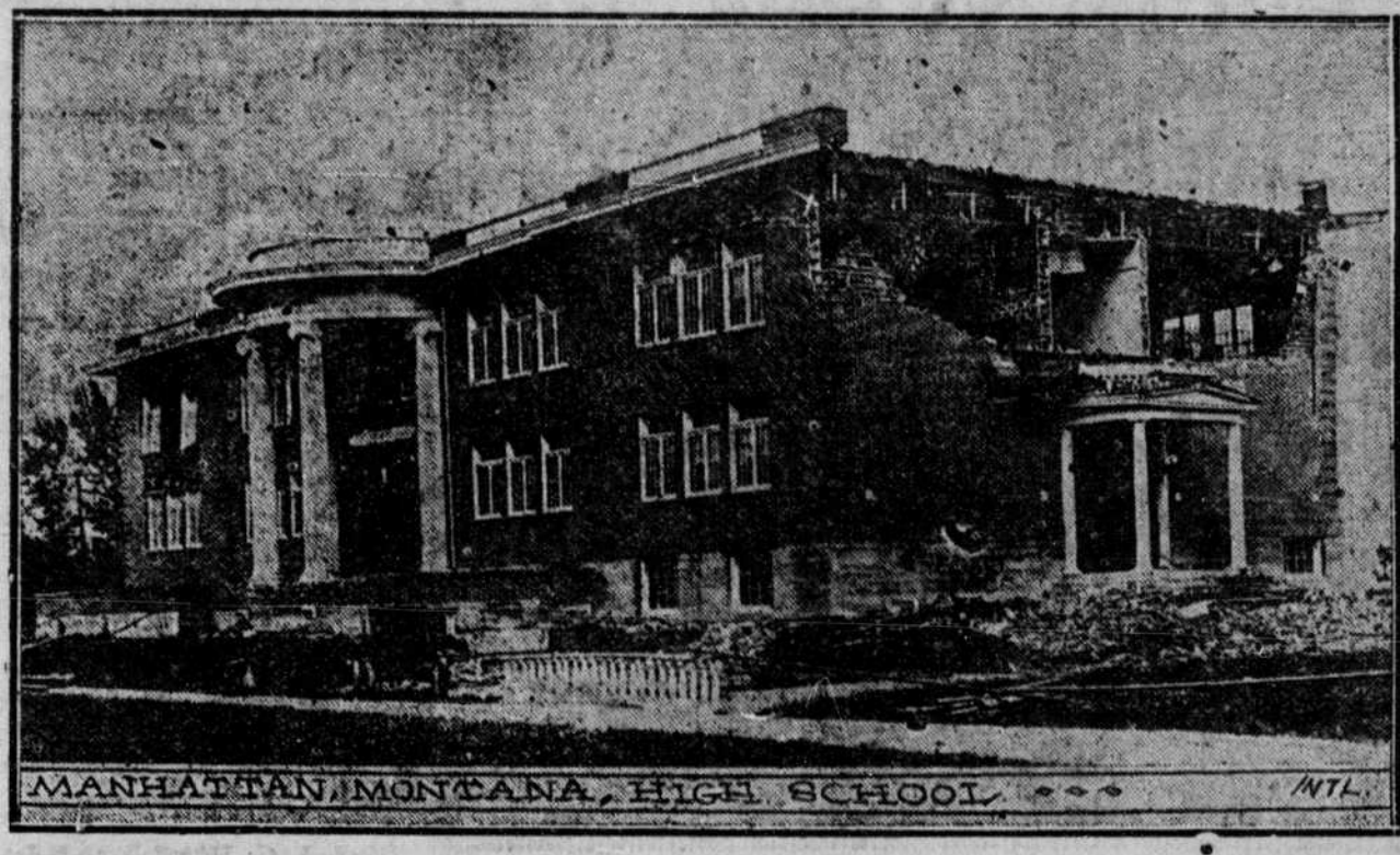
Several students were injured when the Manhattan High School, Manhattan, Mont., was partially wrecked by earth temblors. The most Frious damage occurred at the north and south ends of the building.