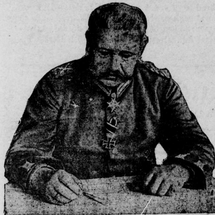
FIELD MARSHAL VON HINDENBURG

Field Marshal von Hindenburg, one of the most picturesque figures in the imperial and republican history of Germany, has been nominated for President of the German Republic by the National-Conservative bourgeois block. Von Hindenburg's nomination brought down a storm of disapproval fully as strong as the cheers of his supporters, many of the old regime literally standing aghast "that the one remaining figure of the glorious past" be dragged into German party politics.