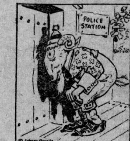
The Wild Gazook Waited With His Eye to a Crack in the Door.

so he sat down again and waited to be told who the mean man was. Finally Raggedy Ann said, "Mister Gazook, your story was very, very sad and as we wish to help you find your dear Grandma, we will show you where the mean man is. But, it will be best for us not to let him see you." "If he sees you, he will not tell us