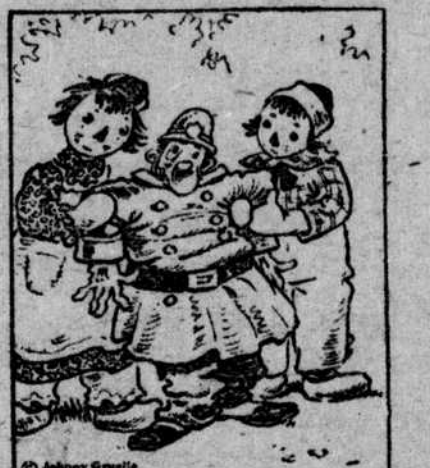
With Raggedy Ann on one side and Raggedy Andy on the other he was able to walk along.

"Dear me!" Raggedy Ann said when she saw that the nice fat policeman had broken the bottle of Magical Shrink Medicine in his pocket and it had made him shrink and shrink until he was a strange sight. "What shall we do?" Raggedy Andy could not say, neither could the Hoolygoolys, so the four friends sat down on the soft moss and tried to keep the policeman from crying so much. "Oh, I wish that the mean old Magician had not sent his puppy dog home for the Shrink Medicine!" the nice policeman sobbed. "For then I would not have had the bottle in my pocket and then I would not have broken the bottle and spilt the Magical Medicine all over me! My! I feel so shrunky! Am I shrinking any more?" "No!" Raggedy Ann hastened to say as she wiped the nice policeman's