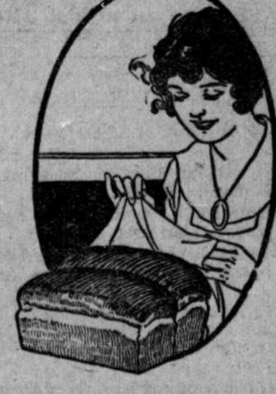
Northwestern Yeast Co. 1730 North Ashland Ave. Chicago, Ill.

Didn't Want to Be Rude. "These here song writers," declared Uncle Pennywise, "don't seem to care a hoot about etiquette or the ordinary determine how silver may be used in procedure of life. There used to be one of them, for instance, who was The survey will be undertaken by the always extending the invitation- bureau of mines, because of the de-Come where my love lies dreaming, crease in demand for silver for mone-Gal in hammock, I suppose, flowery bower, and all that sort of thing. Still, Pittman act, Secretary Work declared, I never went with him to where his had left silver producers facing the love lay dreaming. I didn't think it necessity of a new market. would be polite."