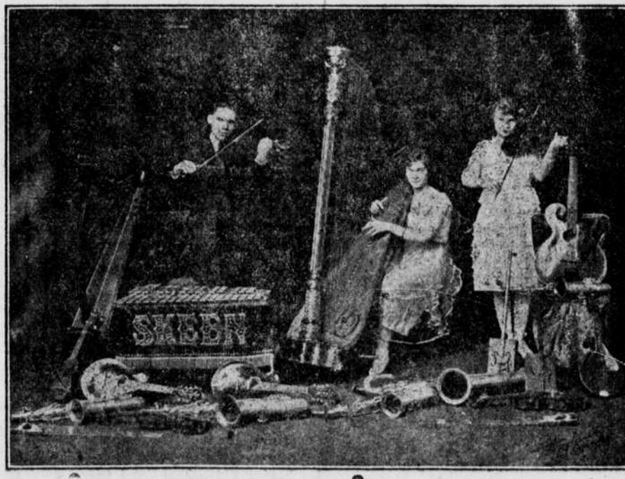
THE SKEEN JUVENILES

REMEMBER WE GUARANTEE TO PLEASE OR REFUND MONEY ADMISSION :: 22c and 50c Plus War Tax Program Starts at 8:15.