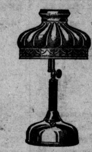
our Demonstration of man Lamps and Lanterns y day, Feb 10 to 19th.