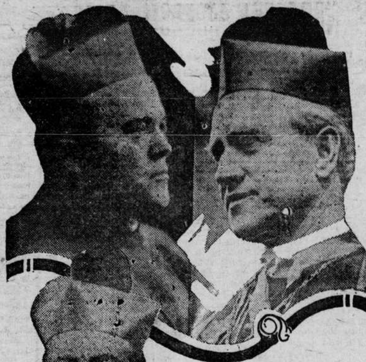
Archbishop D. S. Dougherty, upper left, Archbishop Patrick Hayes, right, and Archbishop George Mundelein.

New York, Feb. 15. (Special).—The visit of Archbishop Hayes, of the New York diocese, to the vatican has stirred up considerable interest in the report that at least one more cardinal is to be appointed for this country to fill the vacancy left by the death of Cardinal Farley. It is hinted that the