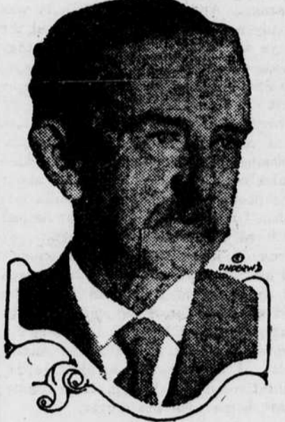
W. Murray Crane.

W. Murray Crane, who has loomed as one of the big figures in Republican national conventions for many years, recently announced his retirement as national committee-man from Massachusetts. He will be present, however, at the Chicago convention. Crane has been a member of the Republican national committee almost uninterruptedly since 1892.