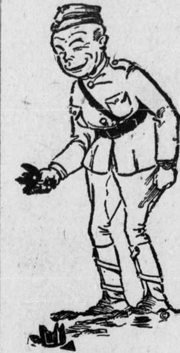
41. John Barleycorn's last order will be bier.

And beer won't quench his thirst very much.