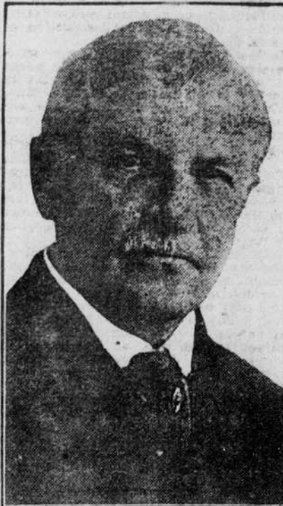
Judge Charles B. Letton