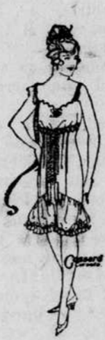
Ideal Figure Short Slender