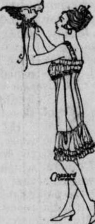
Ideal Figure Curved Back