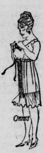
Ideal Figure Short Heavy