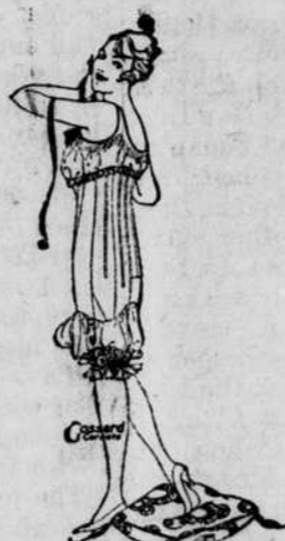
Ideal Figure Large Above the Waist