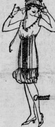
Ideal Figure Short Waisted