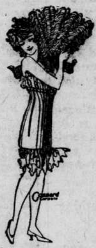
Ideal Average Figure

This name Gossard on the inside of the corset is your guarantee of the original