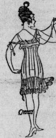
Ideal Figure Large Below the Waist