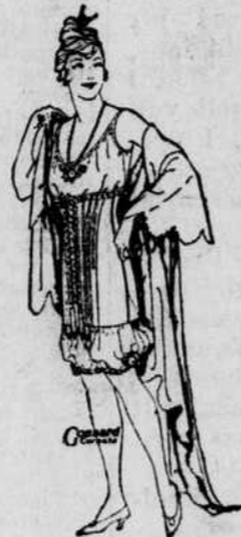
Ideal Figure Tall Slender