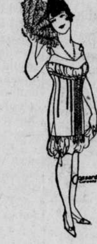
Ideal Figure Tall Heavy