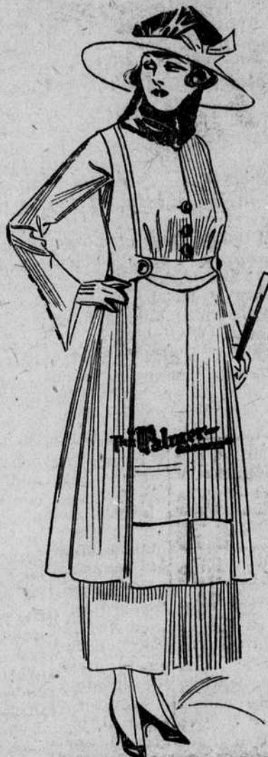
A suit smartly fashioned from a new and beautiful silvertone cloth, lined to waist with peru de cygne. Jacket is gathered at waist, back and front and finished with small belt of soft folds. Unpressed pleats give the sides fullness. The large collar of kalinsky cone is convertible. Unpressed skirt has fullness confined in box pleats in back and tucks at front at $25.00, $28.50, $32.50, $35.00, $40.00