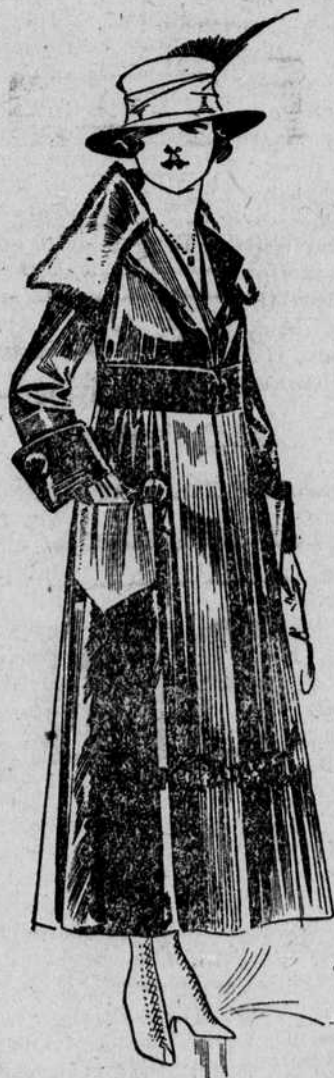
This model of high pile Hudson seal plush, lined with fancy silk. The large kimona sleeves have deep cuffs and the cape collar buttons snugly to neck. A wide loose belt gathers in the fullness at waist, and silk cord loops with self. Buttons are used for fastening. At $25, $28.50, $32.50, $35