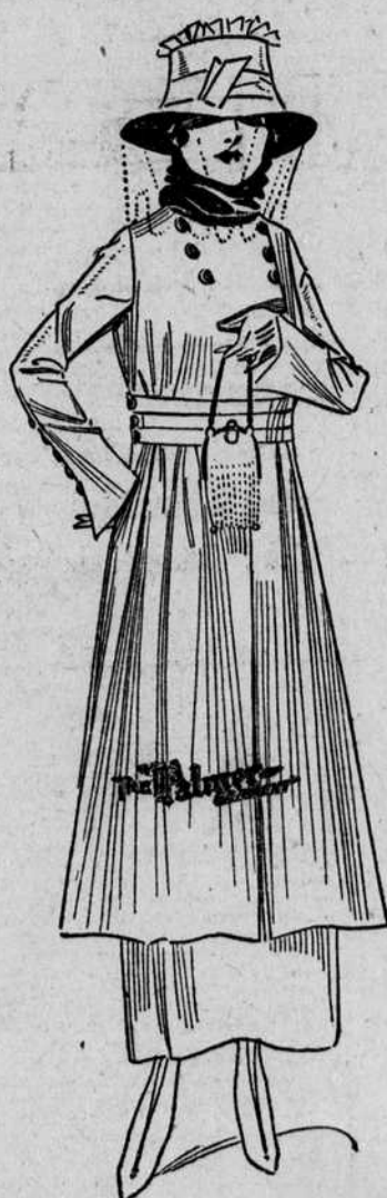
This season's popular number made of broadcloth, with high waist line effect. Muffer collar of black velvet, trimmed with velvet buttons. Diamond cut cuffs. Skirt has pockets and belt to correspond with jacket. Comes in all shades, black, green, toupe, burgundy and plum, at $35.00, $38.50, $40.00, $45.00