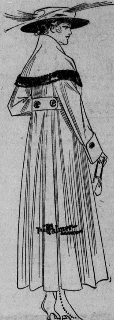
A model of complete refinement made of chiffon broadcloth, fifty inches length. Large convertible collar, edged with keramie, wide belt at waist line. Full silk lined, in all shades at $35.00, $40.00, $45.00, $50.00, $55.00