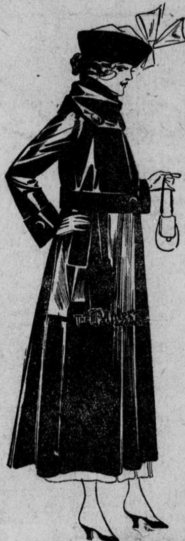
This model of refined dress of velour velvet, beautifully draped. Has a tendency to reduce the form. Large convertible collar. Belted at waist, to gather in fullness. Lined throughout with fancy silk. Self trimmed buttons at $50.00, $55.00, $60.00