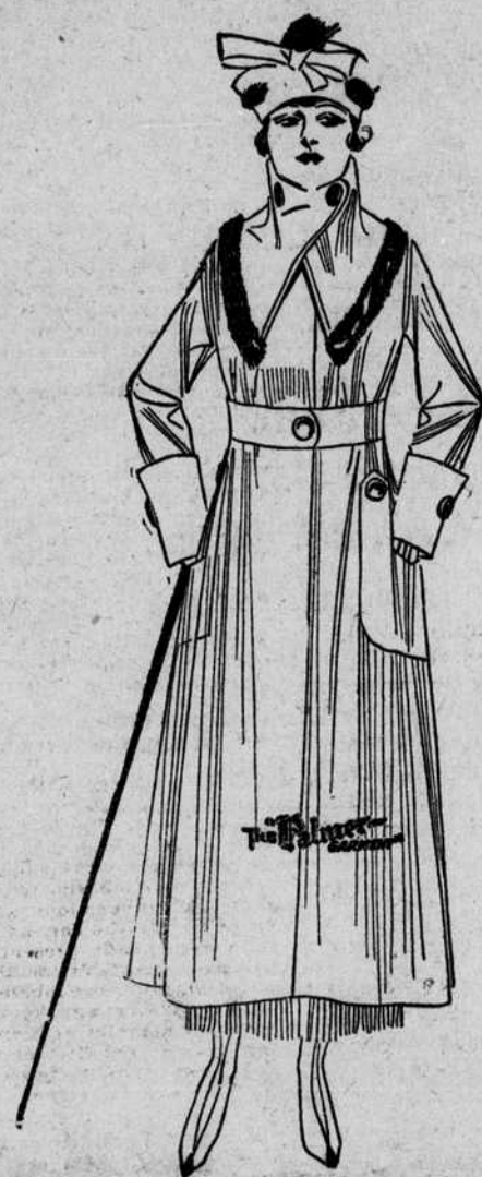
A well designed model of velour, belted at waist, convertible collar. Deep cuffs trimmed with buttons. Patch pockets. A classic number. Green velour, taupe, peacock, cuban brown, pekin, at $18.50, $20, $22.50, $25, $28.50

Yes, I am now in the front ranks with the Palmer Garments and have a $10,000.00 stock from which you can make a selection. These garments are the very latest in cut, shade and cloths and we are convinced we can please you in style, quality and price. We show here a few of the many choice garments we have in stock, space forbidding a cut and description of the many beautiful creations we have purchased for our patrons.