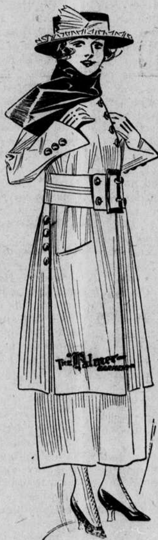
This model of perfection made in all shades of poiret twill, the most refined cloth produced. With wide Pan velvet scarf collar, buttons close at neck. Wide belt in soft folds, with metal buckel, skirt gathered in back with plain front and pockets to harmonize with jacket, at $40.00, $50.00, $55.00, $60.00