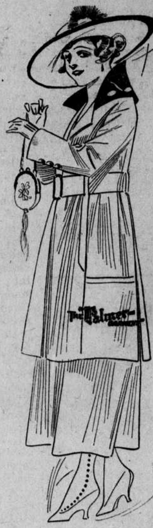
This model is a classified miss or small ladies' garment producing a chic effect not usually seen, smarter than the average. Made in all shades, navy, brown, green and gold kitten's ear cloth at $38.50, $42.50, $47.50, $55