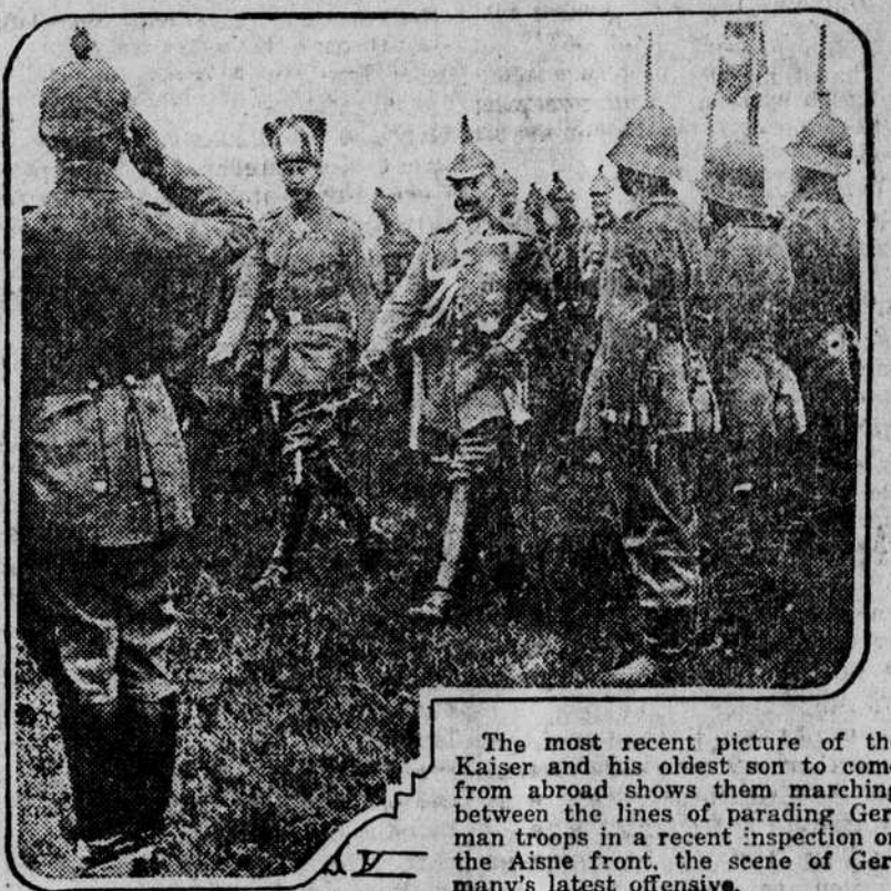
The most recent picture of the Kaiser and his oldest son to come from abroad shows them marching between the lines of parading German troops in a recent inspection on the Aisne front, the scene of Germany's latest offensive.