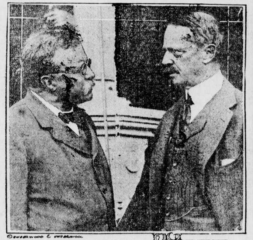
George von L. Meyer (right) telling Col. Roosevelt that people are for him. George von L. Meyer, a member of Taft's cabinet, headed a committee representing an organization of Taft Republicans, which recently called on Colonel Roosevelt at Oyster Bay and informed him that the Republicans who supported Taft four years ago are for Roosevelt for president now.