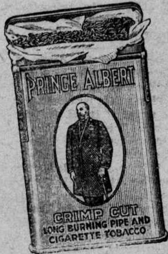
On the reverse side of this tiny red tin you will read: "Process Patented July 26th, 1907," which has made three men make pipes where one smoked before!