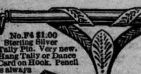
No. F 8 $1.00 Sterling Silver Tally Pin. Very new. Hangs freely or passes card on hook. Tally is always convenient.

This store is able to offer you newest designs and styles and exceptional values.