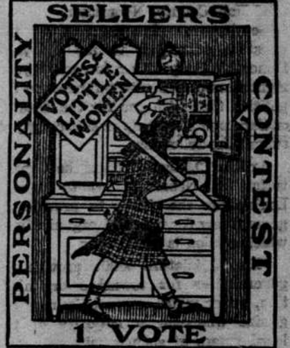
Ten of these 1-vote stamps are good for 1 10-vote stamp.

The contest closes Christmas Eve, so do now what you can toward helping the little girl you want to have this wonderful possession.