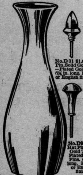
No. D 91 $1.00 Hat Pin, Solid Gold Top—Plated Gold Pins. 6 1/2 in. long, Roman or English finish.

Won't you come in and examine these and our hundreds of other charming gift suggestions for the Holiday season?