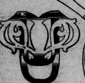
No. G 81 $1.00 Sterling Silver Napkin Marker (actual size). Heavy weight.