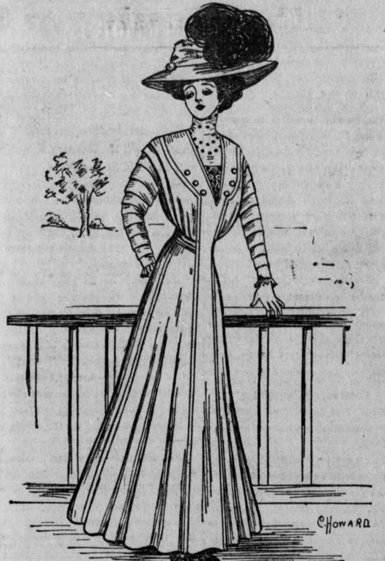
FROCK OF CLOTH OR RAJAH.