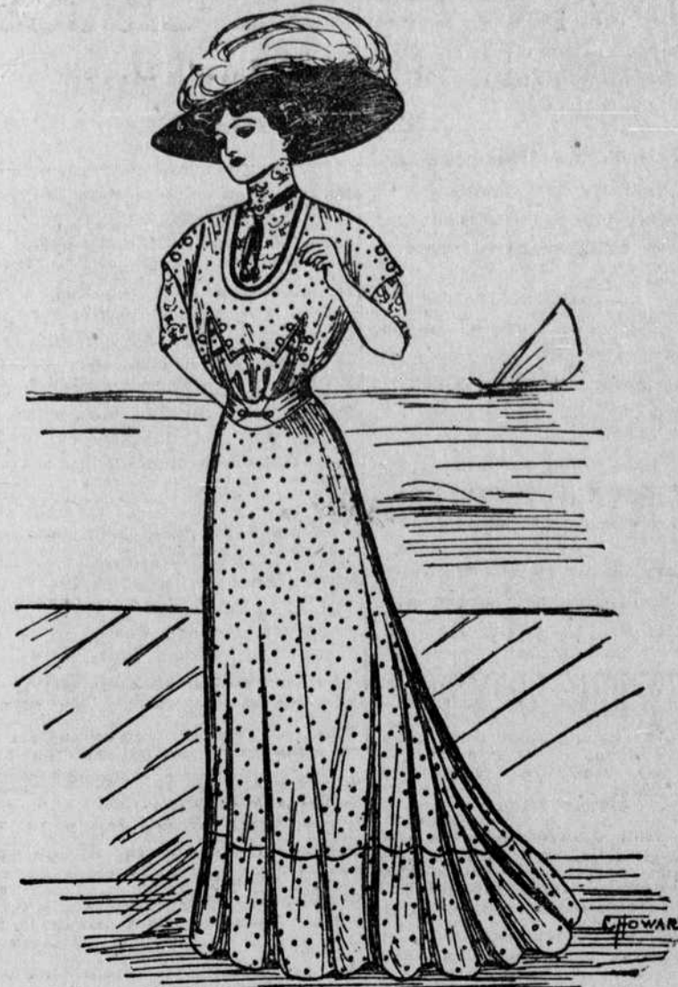
GOWN OF DOTTED FOULARD.

White foulard silk dotted with coin spots in black was used for the model here pictured, the trimming of the gown being stitched bands and straps of black satin and buttons of the silk. The yoke was of sheer tucked white mull, inserted with lace, and the trained skirt had a deep applied hem piped with black.