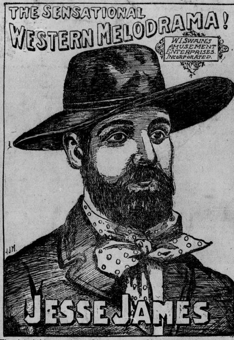
The plot of this sensation and instructive production is based upon the life of the most interesting character history has furnished.