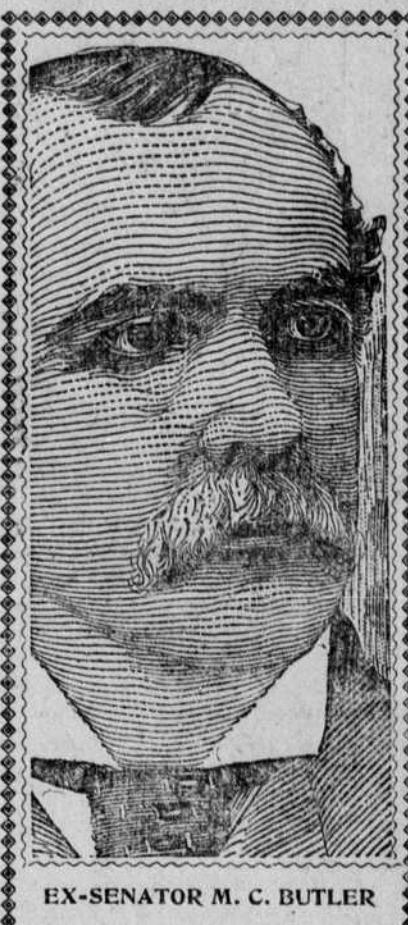
EX-SENATOR M. C. BUTLER

Catarrh of the Stomach is Generally Called Dyspepsia—Something to Produce Artificial Digestion is Generally Taken.