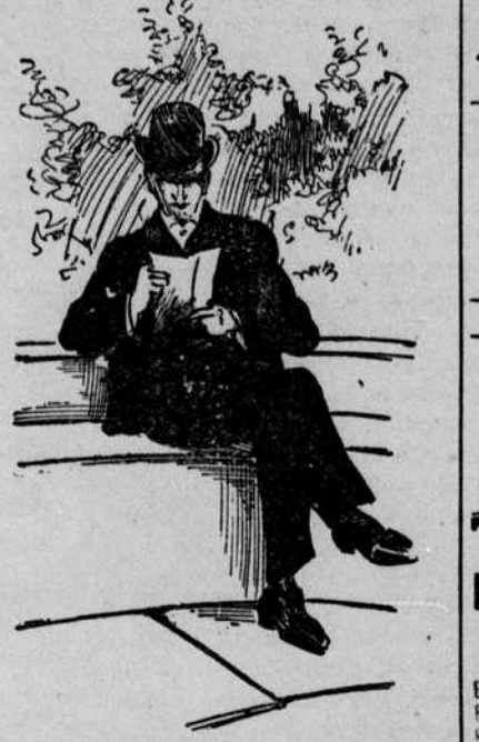
He drew forth again that thin, type-written sheet.

Consumption The only kind of consumption to fear is "neglected consumption." People are learning that consumption is a curable disease. It is neglected consumption that is so often incurable. At the faintest suspicion of consumption get a bottle of Scott's Emulsion and begin regular doses. The use of Scott's Emulsion at once, has, in thousands of cases, turned the balance in favor of health. Neglected consumption does not exist where Scott's Emulsion is. Prompt use of Scott's Emulsion checks the disease while it can be checked.