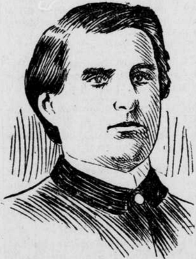
McKINLEY IN 1866.

If the President thought of himself at all in his last moments he could have taken comfort in the reflection that he had well-nigh fulfilled his mission—that he had done for the people all and more than they had expected of him, and had won for himself fame that time cannot obliterate. So far as one can read the future there was