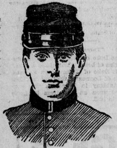
McKINLEY AS A RAW RECRUIT. (At the time of his enlistment in the Army.)

The life of President McKinley, which had been sustained with power-