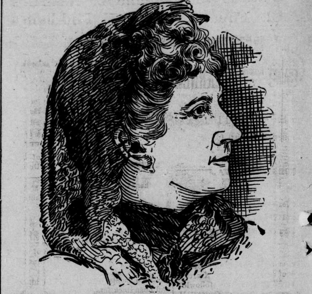
MRS. BELVA A. LOCKWOOD, LATE CANDIDATE FOR THE PRESIDENCY

REGARD PERUNA AS THEIR SHIELD AGAINST CATARRH, COUGHS, COLDS, GRIP AND CATARRHAL DISEASES.