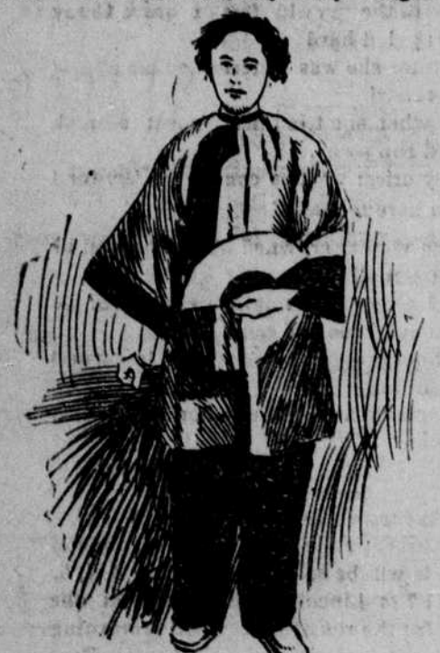
MISS TILLIE FAHR, In Native Costume.

"The Chinese troops were everywhere. Two days before the alarm, 1,700 Russian troops arrived. They saved our lives. Had it not been for them all of us would have been slaughtered. On that Monday they fought