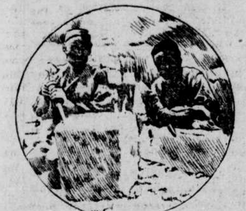
THE STONE CUTTERS.

How needful is economy may be judged from a few figures. Unskilled laborers are paid upon an average 7c a day. Masons, carpenters and stone cutters, here as elsewhere the aristocracy of labor, get from 25c to 30c a