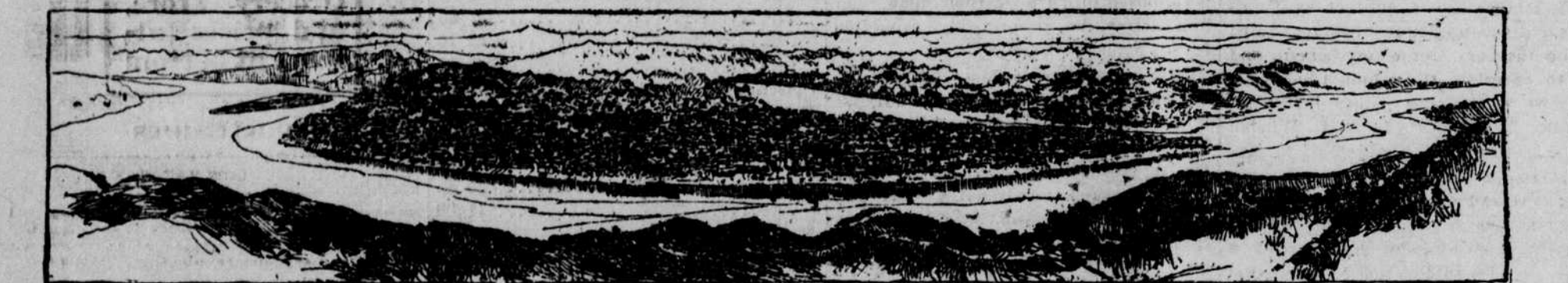
A VIEW OF THE CITY OF CHUNG KING FU, IMPORTANT COTTON CENTER AND A BOXER STRONGHOLD.