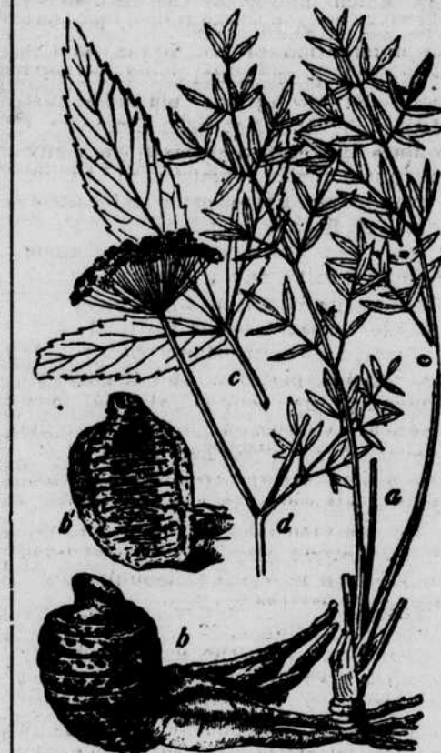
Fig. 17.—Oregon water hemlock (Cicuta vagans): a, plant with leaves, one-sixth natural size; b. rectstock and horizontal roots; b', section of rectstock, half size; c, terminal leaflets, oneefath natural size; d, flowering spray, full etso.

Oregon Water Hemlock. This is a smooth perennial, with erect or straggling glaucous stems three to six feet high, compound leaves, which spring directly from the ground, white flowers, blooming in July and August, and a fleshy root, which has a muskrat-like odor, and which consists of two very distinct and characteristics parts. The more conspicuous of these is the vertical rootstock, which is from one to six inches long by one or two thick, and is curiously divided into numerous chambers by horizontal partitions. This rootstock furnishes the bulk of the poison. The other portion of the root consists of solid, fleshy fibers, which run along on or just under the surface of the soil, and send off numerous rootlets from beneath. The rootstock rots or dwindles away almost entirely before the seeds ma-