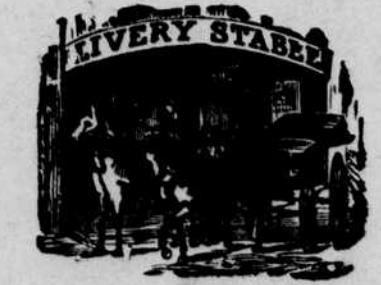
GOOD TEAMS, NEW RIGS Prices Reasonable.