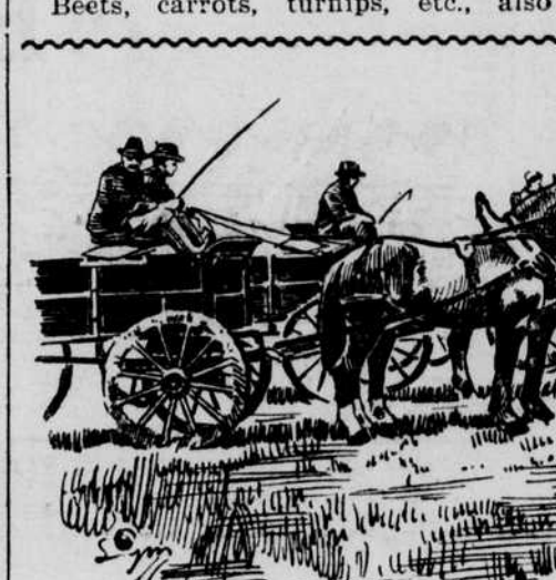
FARMERS' TEAMS AT A WESTERN CANADA FAIR.

The only remaining territory on this continent in which ranching on a large scale can be gone into is to be found in western Canada. The District of Alberta, immediately east of British Columbia, is pre-eminently fitted for ranching. Its area is 400,000 square miles, and it extends from north to south 430 miles, and from east to west 250 miles. The opportunities offered here in this respect are unparalleled by any other country in the world. The country is open, rolling and well wa-