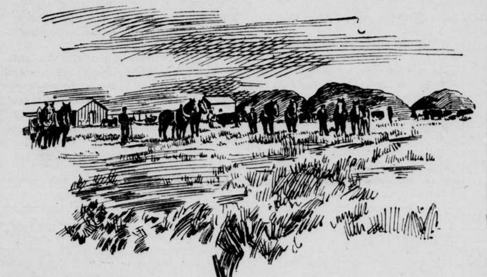
AFTER THREE YEARS' RESIDENCE IN ALBERTA, WESTERN CANADA.

hundred miles northward of the Canadian Pacific Railway. To the west of this vast territory lies British Columbia with its innumerable rivers, rich in fish, its gold, silver and copper mines and its fertile valleys capable of producing the choicest fruits in great abundance. It is to that portion of western Canada lying between Lake Superior on the east and the Rocky mountains on the west that the attention of the agriculturists throughout the world is being directed at present and it is to that district they are looking for homes for themselves and their children, and for the solution of problems created by the overcrowding of population in the older countries and the United States. A few authenticated facts regarding this vast region and the infinite pos-