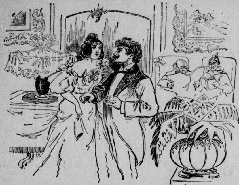
UNDER THE MISTLETOE! TO THEIR CHEEKS THE WARM BLOOD FLIES AS INTO HER EYES LOOK HIS, BUT—THERE ARE OTHER EYES.