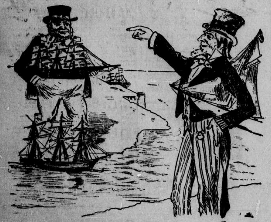
Uncle Sam—Why don't you build some yachts that can race? John Bull—Why don't you build some ships that can carry freight?

Dishonest Tobacco Importers. From the duties upon imported tobacco, the government receives a large revenue. Under the Dingley Tariff that is known as filler tobacco pays from 35 to 50 cents per pound and wrapper tobacco from $1.85 to $2.50 per pound. There have been great frauds practiced upon the government in the importation of tobacco and it is pleasing to see the present energetic policy of the treasury department in checking them. The most common practice of undervaluation is what is known as "nested goods"—that is, a bale of tobacco may contain a certain amount of wrapper and a certain amount of filler, and be entered as filler tobacco, thus avoiding the higher rate of duty upon the wrapper tobacco. Another plan of avoiding the collection of the duties is to have bales of tobacco similarly packed, a part of the bales being filler and another part being wrapper tobacco, but all being entered as filler.