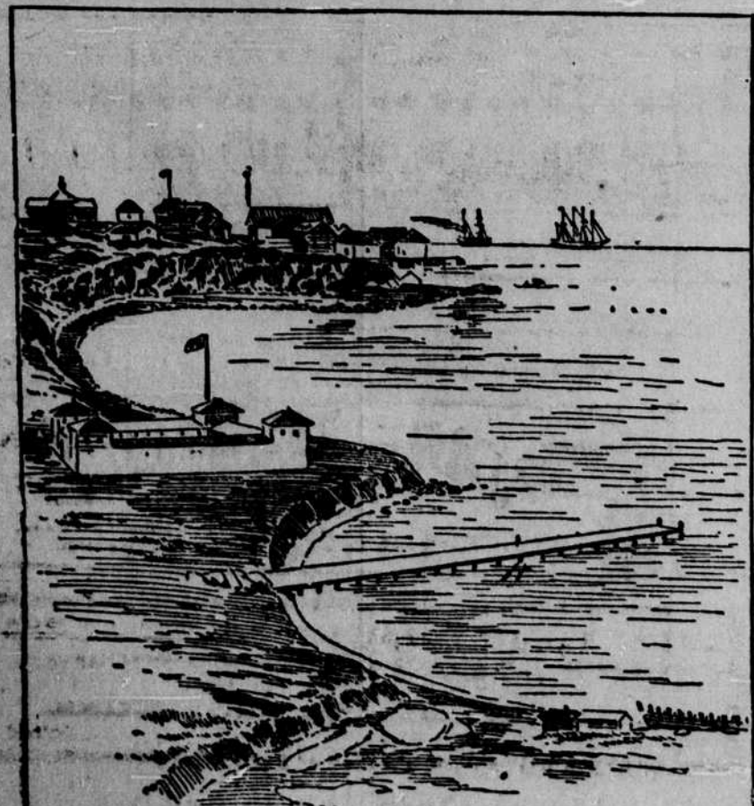
TRADING STATION ON THE YUKON.

Canada's Policy is Criticized. On July 27 the Dominion cabinet decided to demand a royalty on the output of the new diggings of the Yukon. Under regulations previously issued, a fee of $15 per claim for registry and a tax of $100 per annum were imposed. Now, in addition to this, a royalty of 10 per cent of the output is to be collected from all claims producing $500 per month, and 20 per cent on those producing more than that amount. Moreover, every alternate claim on all placer ground is to be reserved as the property of the government, to be sold or worked for its revenue. The establishment of such a system, which is, we believe, without precedent on this continent since the end of Spanish rule in Mexico, is startling to those