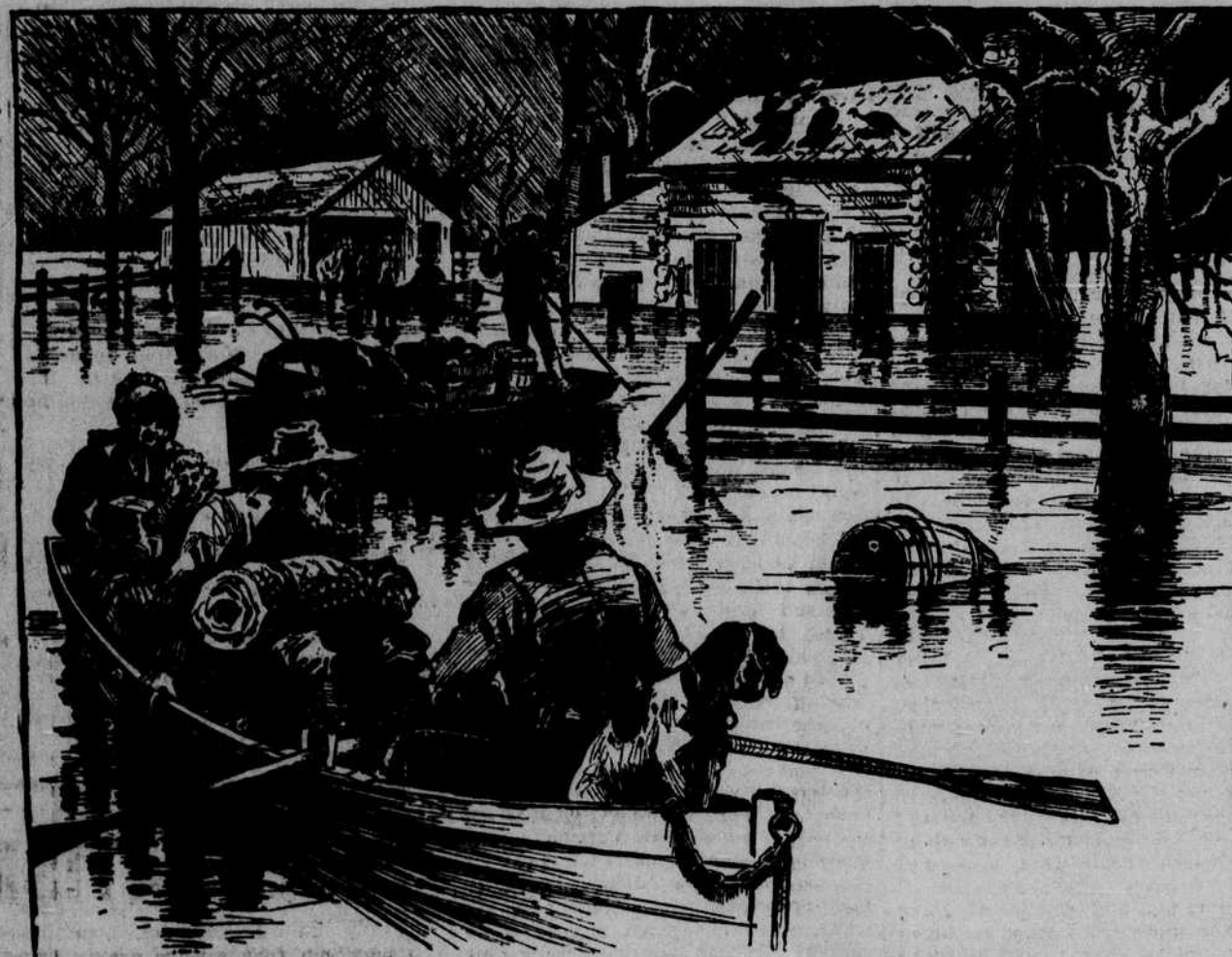
LEAVING THE OLD HOME TO TAKE REFUGE IN THE HILLS.

Of the 10,000 car-loads of oranges that will be marketed in California next season fully 6,000 will be navel.