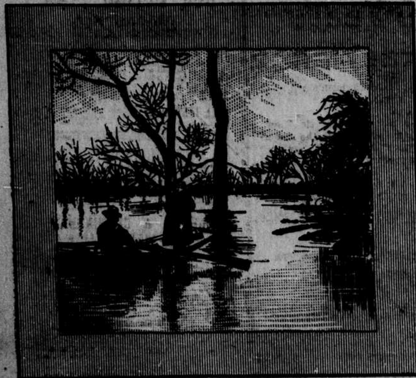
A NEWSPAPER CORRESPONDENT NEAR GREENVILLE.

havoc with railroads in the valley east of Yankton, S. D. The water is a foot higher and threatens to take out bridges and tracks, as the approaches at both ends of the bridges are cutting badly. Three miles and over of track of the Great Northern, Milwaukee and Northwestern railroads is now completely disabled, thus cutting Yankton off from the outside world. Farmers in the bottoms are moving out with boats. Word was received asking for immediate assistance, and men and boats are departing for the flooded district. The water still continues to rise at Yankton. The ice is broken at Grand Forks, N. D., and trouble is expected from that source. Basements in Third street stores are cleared of all goods. Above Grand Forks the ice