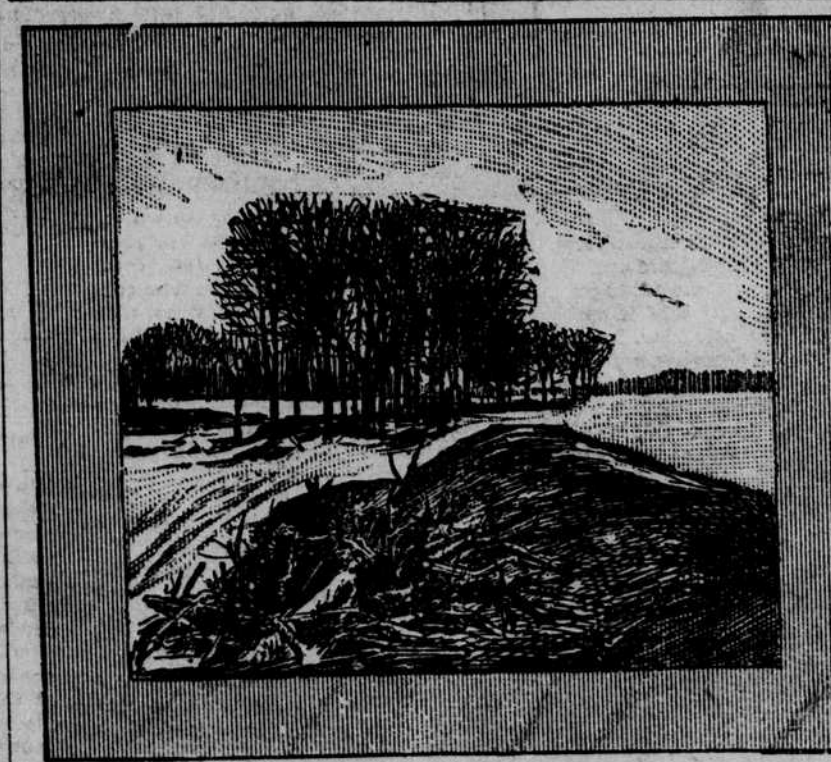
A BREAK IN THE LEVEE NEAR MEMPHIS.