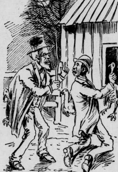
"Didn't I often tell you 'bout keeping de fifth commandment? You must dun go an' put dem dar fowls where you got 'em, or I'll 'pose you to der whole congeration to-morrow."