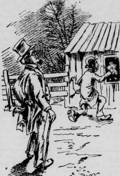
He was dun called. But on his way home sees a wicked sight. "Well, fo' de Lawd's sake! If dar ain't Brother Brownly lifting Brother White's fowls."