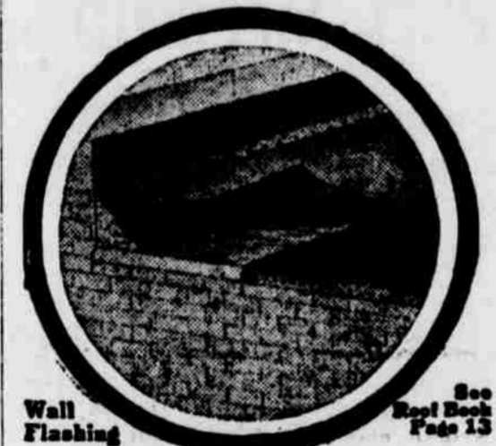
Wall Flashing See Roof Book Page 13

HARDWARE AND LUMBER DEALERS can make profitable connections with us in towns where we have no distributors. Write. Goods shipped from our warehouses at all principal Railroad distributing centers, making possible quick deliveries and low freight.