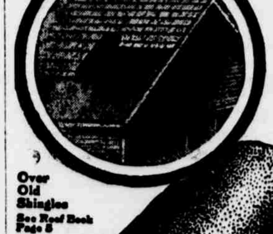
Over Old Shingles See Roof Book Page 8