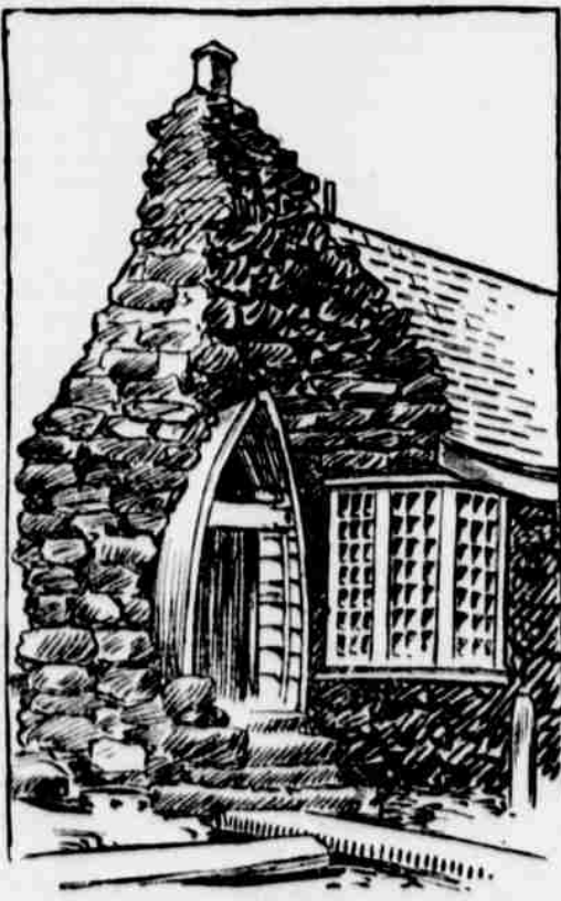
Queen's Bungalow Built of Coastwise Material.

London.-Queen Alexandra has a unique bungalow. It is in Norfolk down by the beach of Snettisham, a quaint watering place of 15,000 people. The beach, a favorite with the queen, is crowded in the summer season with holidaymakers, tourists and others. The Gothic door or main entrance to the bungalow is nothing else than a rowboat cut in half. The outer walls are of bright yellow cast stones brought from the Snettisham pits and