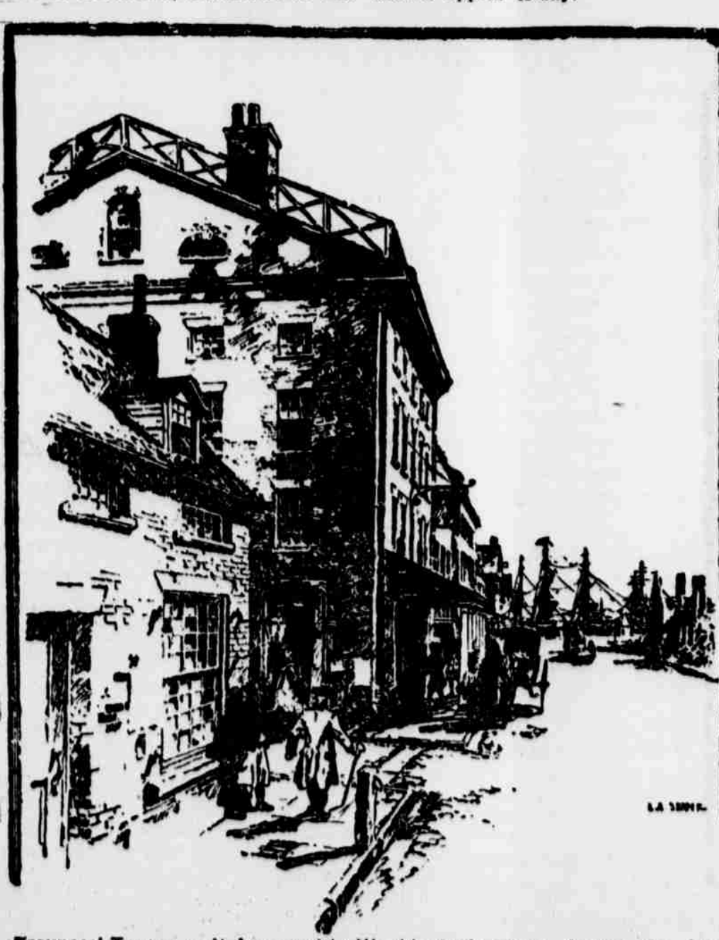
Fraunces' Tavern as It Appeared in Washington's Time-Across the Street Are Shown the Ruins of the Fire of 1778.