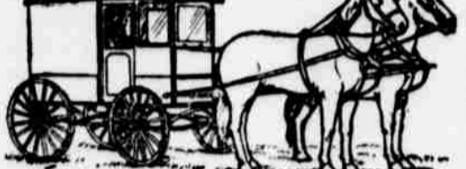
A REGULAR TRAVELING STORE

Also I want to tell you that Security Antiseptic Healer is as good for barb wire cuts as Security Gail Salve is for harness galls. Dealers carry them in 2c, 5c and 10c sizes. Use them for your needs; I guarantee you perfect satisfaction.