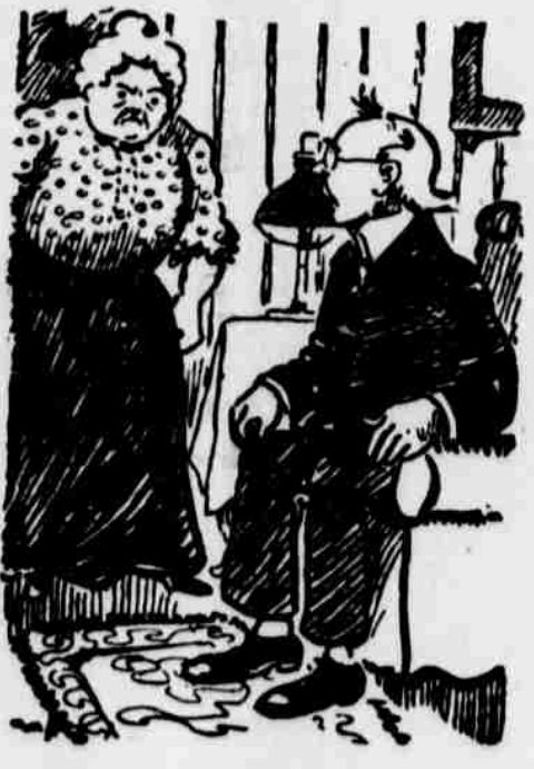
A Hot One.

Mr. Naggitt-I've a great mind to go to the mass meeting tonight.