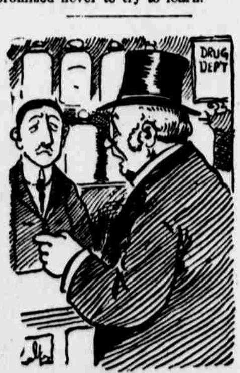
The Doctor-Gracious, man. You gave that poor fellow arsenic yester-

Tom-I know she doesn't mother, and what's better than all she has promised never to try to learn.