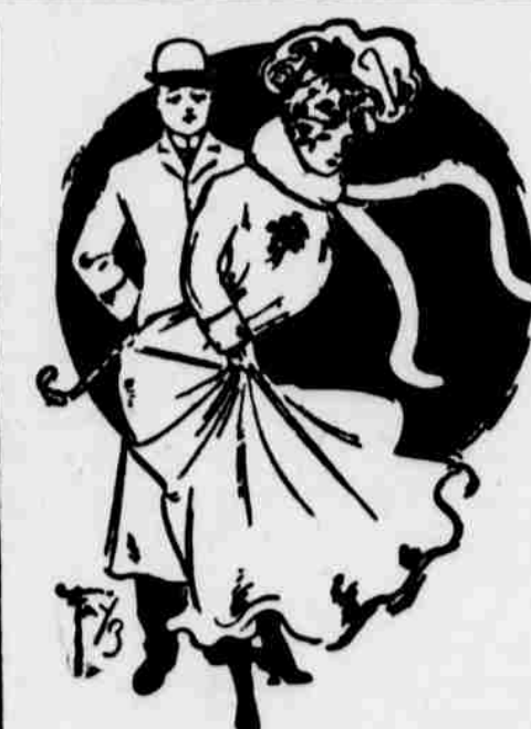
The Way it Works.

She-Don't you think a woman is clever enough to do any work that a man can?