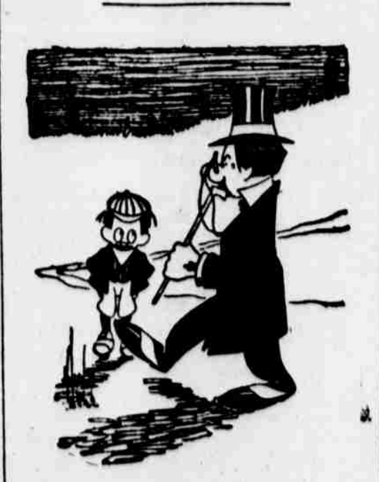
Paying the Freight.

Willie (aged seven)-Say, pa, when a man expresses an opinion can he collect charges on it?