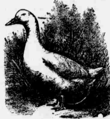
WHITE PERIN DUCKS.

The White Pekin is a popular duck which has a distinctive type especially its own, and differing from all others In the shape and carriage of its body. The legs are set far back, which causes the bird to walk In an upright position. In size these ducks are very large, some reaching as high as twenty pounds to the pair. Their flesh is very delicate and free from grossness, and they are considered among the best of table