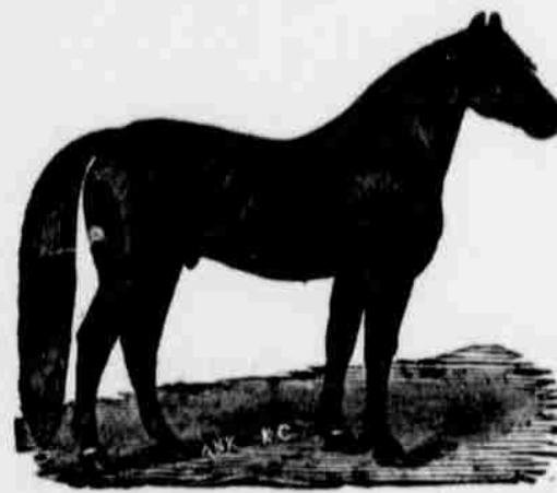
REPUBLICAN JR. 29348