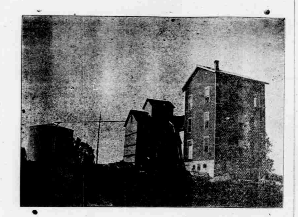
OAK ROLLER MILLS. Capacity 150 bbls. Daily. Metal Storage Bin Attached.

Fine stock and grain farm in the Blue river bottom in Thayer county, No. 110 tion and 150 in prairie. House, eight $2,500 rooms, good repair; barn 30x40 nearly new; double granary, corn cribs, hog house, cow shed and hen house. Fair orchard, 15 cherry and 60 apple trees. 7 miles to good town, 154 fertile farm in German neighborhood and is entitled to be well considered.