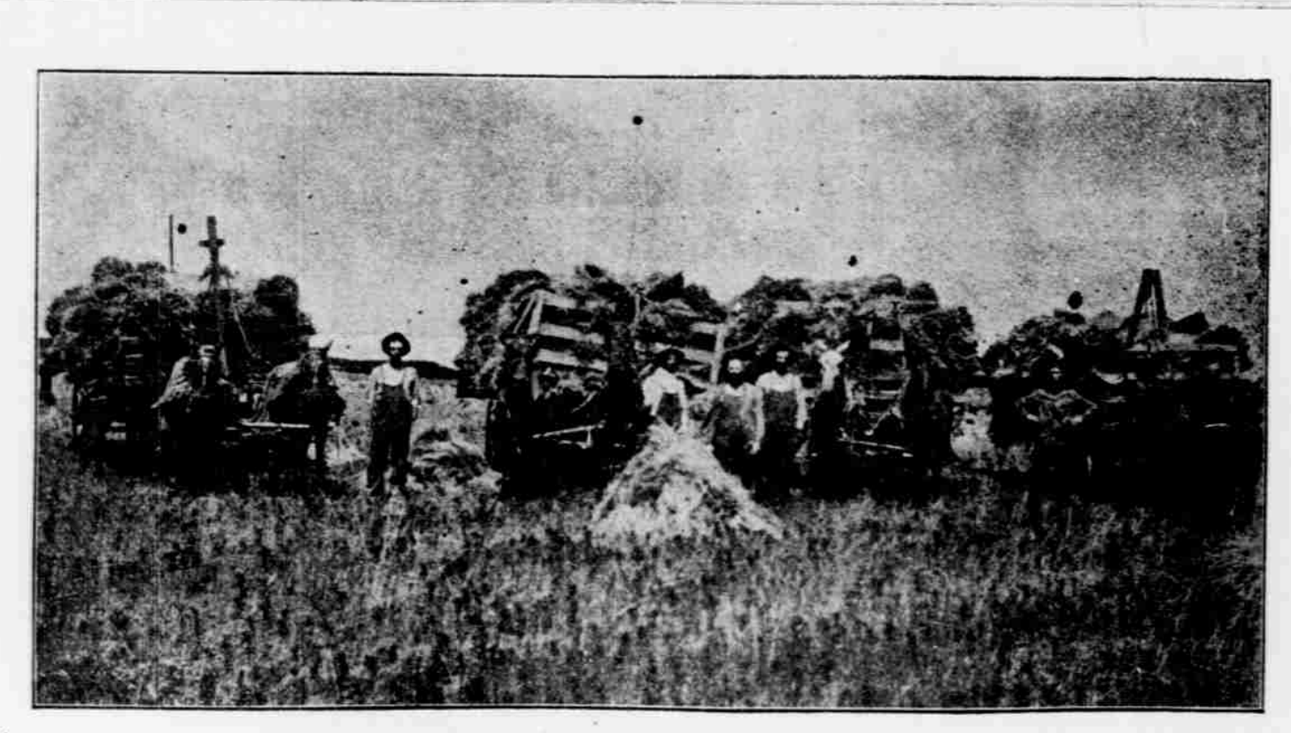
GARNERING IN THE SHEAVES.