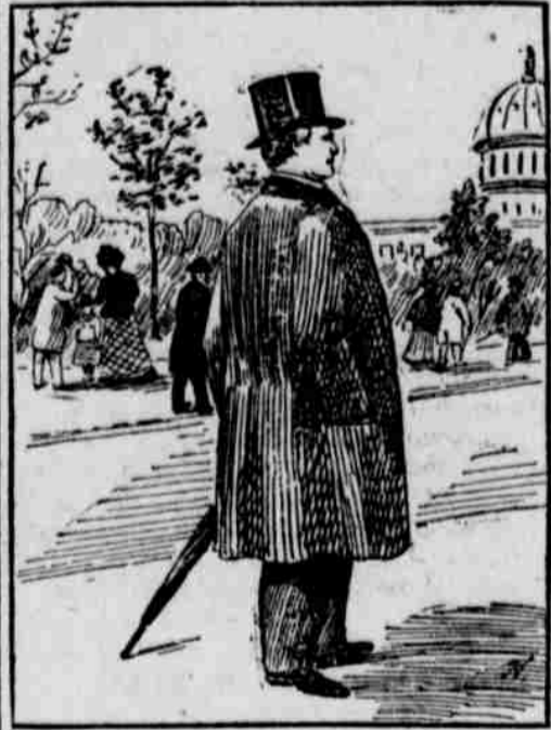
TAKING A STROLL BY HIMSELF.

With Monroe was ushered in the "era of good feeling." Peace had come and the country freed from war was so happy that it would not listen with any sort of patience to any party disagreements or bickerings. Even Jackson, that grim political fighter of after years, wrote to the new president and