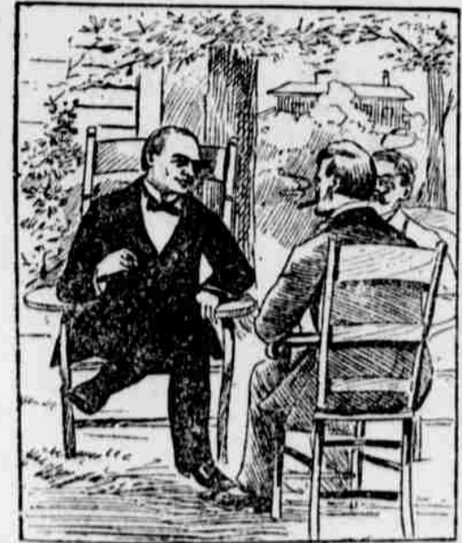
NOT A LONESOME PRESIDENT.

The reader must not erroneously suppose that any unkind reflections